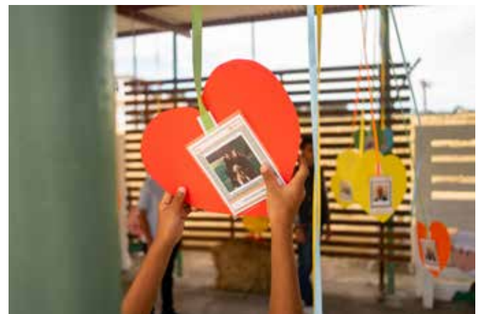
CarePoint children select their friends from profile cards

As an organization, HopeChest often encountered roadblocks due to some countries having negative connotations with the term “sponsorship”. That’s why we initiated the Friendship Model and have continued to implement it in our operations! We believe that having a child select someone they want to befriend provides dignity and empowerment by giving the child a Voice and a Choice in the process. While the Friendship Model wasn’t new this year, we launched 3 new CarePoints under this model, all in Guatemala. The 3 new CarePoint partnerships established 513 new Friendships during this time!