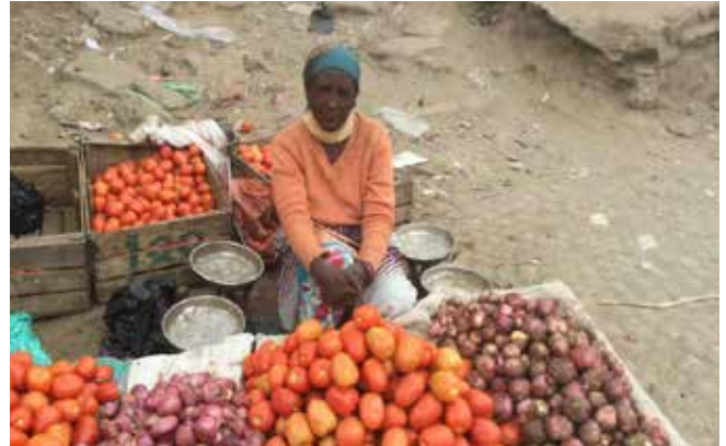
A guardian of a CarePoint child sells food at a market for additional income

HopeChest has dedicated years to fighting global poverty- and we were determined not to lose progress due to the pandemic. COVID-19 caused vast food shortages, disruptions in supply chains, and limited access to nutrition in vulnerable areas. A special Food Security Relief Fund raised $18,157 which provided immediate food relief for the hardest hit families and providing training, equipment, and seeds for families and community gardens to help drive ongoing agriculture.