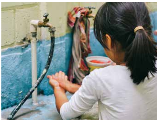
Children learned proper hand-washing techniques.

Children's HopeChest implemented enhanced hygiene procedures and awareness training at CarePoints, as well as adapted operational procedures to reduce gathering sizes and increase distance between staff. A special COVID-19 Relief Fund raised $21,925.00 which provided the most at-risk children and community members with food, soap, hygiene materials, and other emergency supplies above and beyond what normal sponsorship funds could cover.