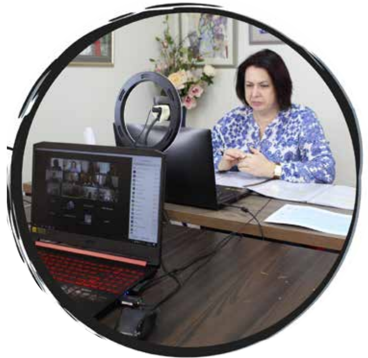
A staff member conducts a virtual early learning education class

Due to the COVID-19 lockdown and restrictions in 2020, indoor and outdoor activities were suspended. We had to find new ways of meeting and teaching from a distance. Our team tried as much as possible to keep contact with families looking to serve them in these hard and fearful circumstances. Therefore, we applied a new format, by which we could continue our lessons, both with mothers and with children. From the start, seven groups were formed and we conducted online meetings in order to inform all parents about changes and new opportunities during the pandemic, as well as share safety measures and give new updates about the restrictions. We stayed in contact on the phone with those mothers who do not have access to the internet. The new training format included lessons for children that were distributed to individual homes, and lessons for mothers that were held on Zoom. The children's lessons were the main story, and came along with all the necessary materials for application, drawing, and other activities, as well as video instructions for each activity that parents needed for their group. Thus, the child and the mothers could engage independently at home, using the materials and video instruction to conduct a full lesson. At this moment, we see the joint activity of the children and mothers as an opportunity to spend more quality time together and develop better relationships.