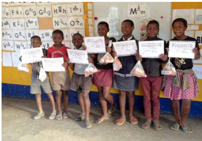
A group of children with their grief support course certificates

In a year full of challenge and uncertainty, the Grief Support Course offered at Eswatini CarePoints became a crucial resource for the community. Even in ordinary times, life always comes with emotional challenges and losses. When the pandemic began, a whole new wave of difficulties emerged- lockdowns, economic shutdowns, social distancing practices, loss of