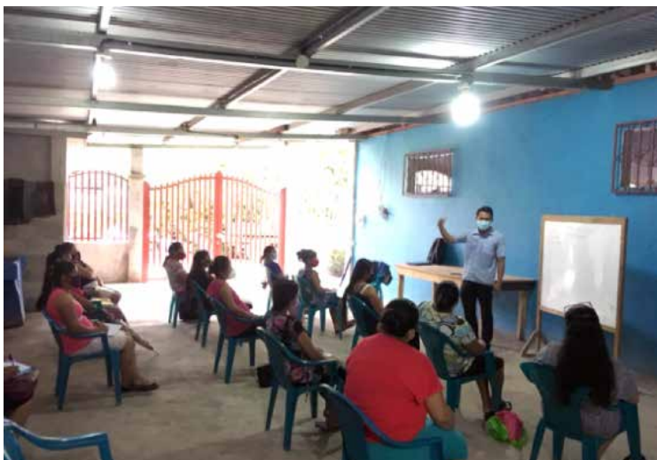
Community members receiving economic empowerment education

The pandemic has hit Guatemala hard. The government locked the whole country down- schools, churches, and businesses could no longer operate. As the situation continued, the economic impact became more and more evident. Many families lost their only source of income. God guided the CarePoint staff to implement an economic empowerment project for the community, starting in August 2020. The project brought a group of 10-20 people together to increase their savings and assets while holding each other accountable. With no outside capital provided, the model powerfully demonstrated the agency and creative capacity of those living in poverty. The members were provided the opportunity to save frequently in small amounts, given access to credit on flexible terms, and a basic form of insurance. The group is also taught what the Bible says about money and how to glorify God with the resources they have been given. The group continues to operate independently after 9-12 months, realizing HopeChest's vision of generational, long-term improvement in the fight against poverty.